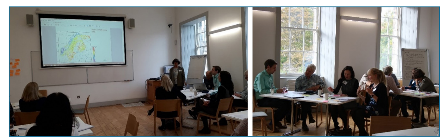
Figure 3: Photo of Workshop event; Sept 2018

Though DOC is primarily viewed as an upland pressure, it can also be a pressure in lowland agricultural catchments, particularly in low-lying areas such as lowland fens;