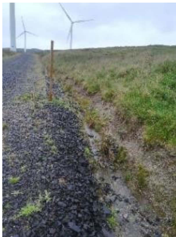
Figure 1: Access track to a wind farm.