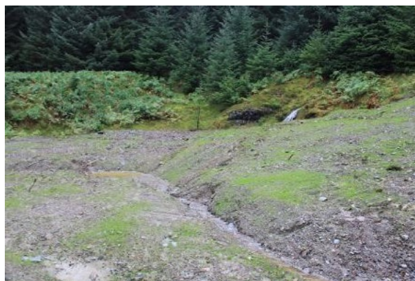
Figure 5. Restoration at the borrow pit showing signs of early recovery with vegetative growth such as Juncus spp. grass varieties, and some Polytrichum spp. and Sphagnum spp. Juncus species colonisation and dominance in some settings is problem due to the hollow stems of the reeds enabling transport of oxygen from above the ground to below, leading to higher rates of decomposition of soil organic matter. Controlling reeds is part of the post reinstatement/restoration maintenance.

The groundwater table in the wetland is often higher than the water table in the borrow pits (e.g., Skaggs et al., 2007). As a result, water within the wetland drains into the borrow pits until a hydrological equilibrium is reached. This change affects the transport of water and nutrients within the wetland ecosystem, which may result in reduction or even termination of biological activities that rely on nutrients carried in the water. Additionally, borrow pits if designed inappropriately could become a barrier for wildlife moving across the wetland.