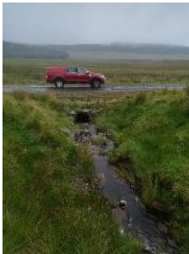
Figure 3. Culvert maintaining surface water flow.

Trenches can be constructed to lay pipelines, cables or for drainage ditches. Holden et al. (2006) suggested that the degradation of peatlands associated with the installation of open-cut drainage ditches (see Figure 3, as an example) has been one of the most significant threats to the sustainability of both upland and lowland peatlands. Trenches often provide a preferential path for drainage of water from within the peat body, diverting away from previous flow paths. To avoid this, it is standard practice to require clay plugs at intervals along the trench with the spacing determined by slope.