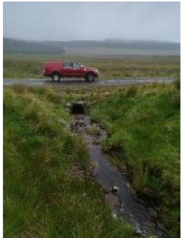
Figure 7. Culvert maintaining surface water flow.

culverts can be placed from one side of the track to the other (see example Figure 7). This also reduces the load of water to be treated via settling ponds and silt fencing. Surface cross drains or SuDS (Sustainable Drainage Systems) can also be used for the flow of water on a track during rainfall or heavy traffic use. Some interviewees did not think this was carried out early enough and many contractors pointed out that installing these was time consuming. This suggested that surface cross drains/SuDS should be designed rather than reactively placed during construction. Therefore, it is recommended that hydrological connectivity is evaluated and any measures to maintain it are included within the planning stage.