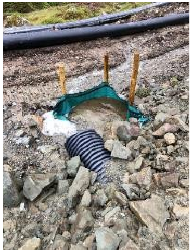
Figure 4: Left panel: Silt-trap. Right panel: Silt trap out of line with culvert.