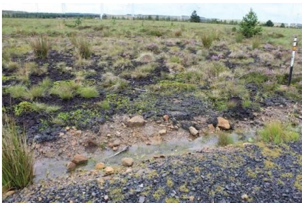
Figure 2: An example of the impact of a windfarm on peat.

In Figure 2, it is observed that the peat spread on top of granular fill material around the concrete base of the wind turbine is bare, cracking and drying out, with no sign of recovery. The habitat at the edge of the turbine base illustrates a thin layer of oxidised peat, with peat loss and with no significant hydrological properties to aid in regeneration of bog vegetation.